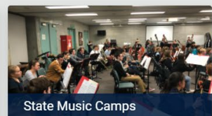
State Music Camps